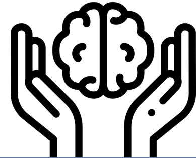
Mental Health and Wellness