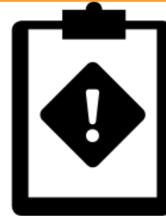
Health Emergency Management