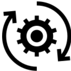
Health Systems Transformation