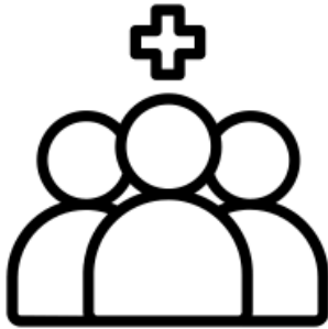
Advance Public Health