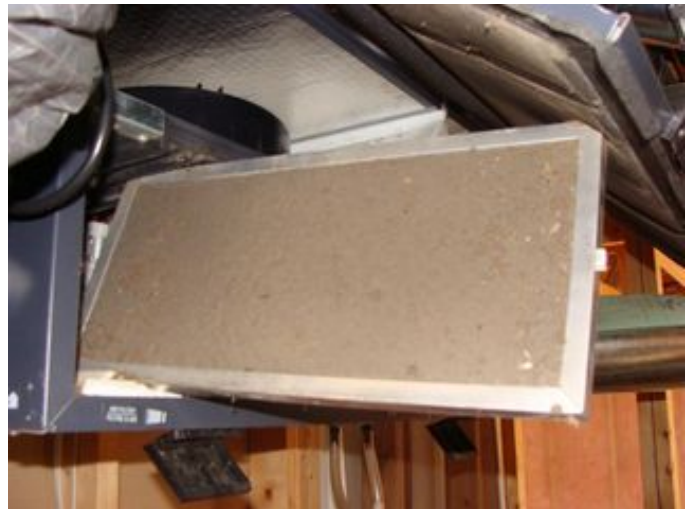
A HRV/ERV filter that needs replaced or cleaned